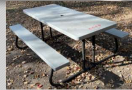
Light Weight Campsite Picnic Table