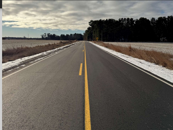
2024 – CTH F Paving