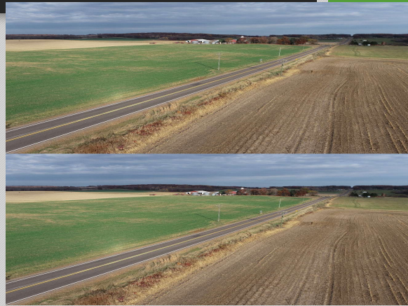
2023 – CTH Q Chip Seal