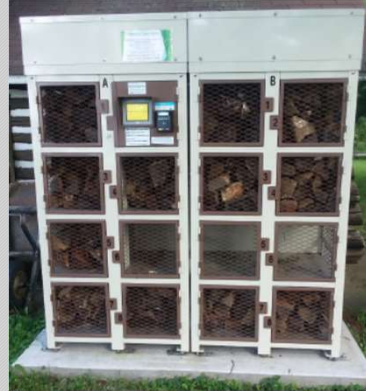
Morris-Erickson Park & Pine Point Park Firewood Dispense (Credit Card)