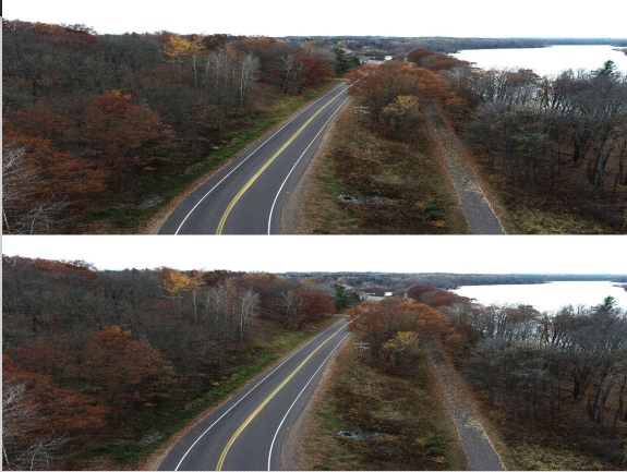
2023 – CTH TT Paving