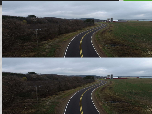
2024 – CTH DD Paving