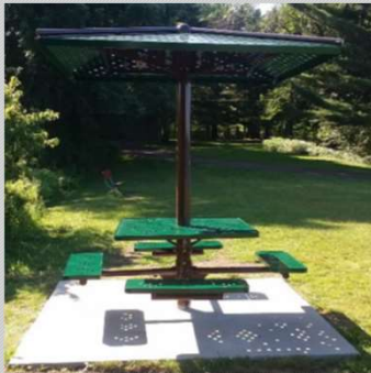
Covered Picnic Table