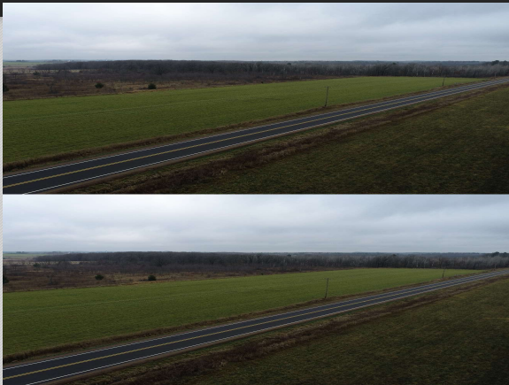
2024 – CTH AA Paving