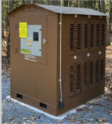
Otter Lake Firewood Dispenser (Cash Only)