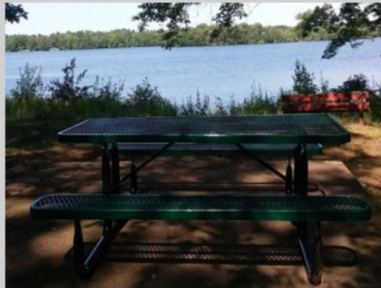
Heavy Duty Beach & Pavilion Picnic Table