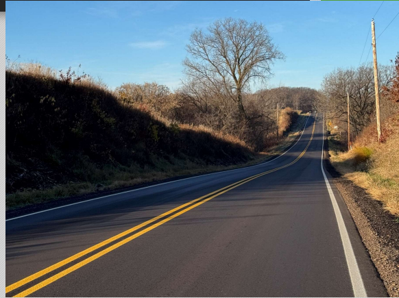
2024 – CTH OO Paving