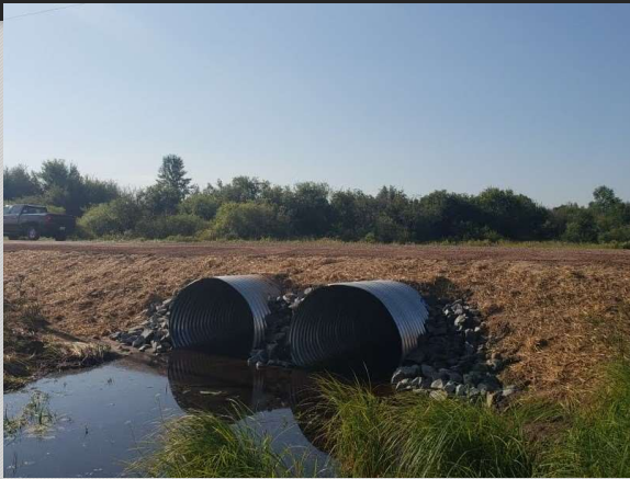
2022 – CTH W Culverts