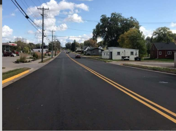
2023 – CTH X in Stanley Paving