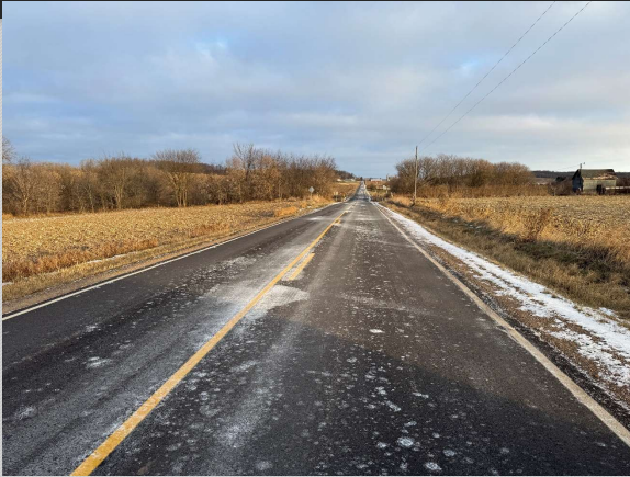
2024 – CTH HH Paving