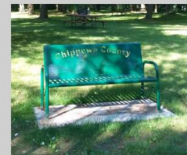
Coated Steel Benches with County Logo